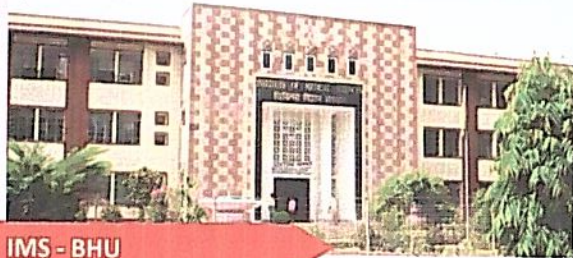
IMS - BHU

Banaras Hindu University and its outstanding achievements are tribute to the vast vision indomitable spirit and unflagging zeal of our founding father "Bharat Ratn" Mahamana Pt. Madan Mohan Malviya Ji. It is a monument to his selfless service in the cause of Indian education. BHU always ranks among top Universities of India, established in 1916. The main campus spreads over 1300 acres. University harbor's 6 Institutes, 16 faculties and 158 departments. Total enrolled students exceed 30,000 per year. It also has over 75 hostels including IMS, IIT, Management Science, Journalism and Mass Communication, Law, Agriculture etc.