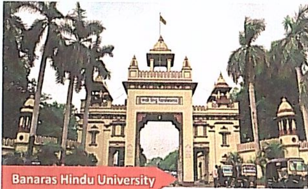
Banaras Hindu University

Banaras Hindu University and its outstanding achievements are tribute to the vast vision indomitable spirit and unflagging zeal of our founding father "Bharat Ratn" Mahamana Pt. Madan Mohan Malviya Ji. It is a monument to his selfless service in the cause of Indian education. BHU always ranks among top Universities of India, established in 1916. The main campus spreads over 1300 acres. University harbor's 6 Institutes, 16 faculties and 158 departments. Total enrolled students exceed 30,000 per year. It also has over 75 hostels including IMS, IIT, Management Science, Journalism and Mass Communication, Law, Agriculture etc.