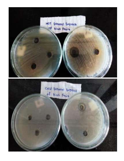
Figure 2: Representative image of Minimum Inhibitory Concentration of Hot and Cold Ethanolic Extracts by agar well diffusion method against Candida albicans .

From above results it can be concluded that CEE was found most potent in inhibition of bacterial pathogens and fungal pathogen as well. The results of Minimum inhibitory concentration of extracts were expressed as mean of three replicates together with standard errors. Statistical calculations were done by Microsoft Excel 2010.