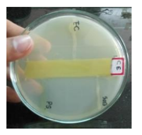
Figure 1: Representative image of Preliminary Screening of extracts for Antimicrobial activity by Ditch Plate Method.

Table III. Preliminary screening of whole fruit extracts of Actinidia deliciosa at 50 mg/ml concentration by ditch plate technique. Key: (+) = Inhibition of Growth. HEE: Hot Ethanolic Extracts, CEE: Cold Ethanolic Extracts, HME: Hot Methanolic Extracts, CME: Cold Methanolic Extracts.