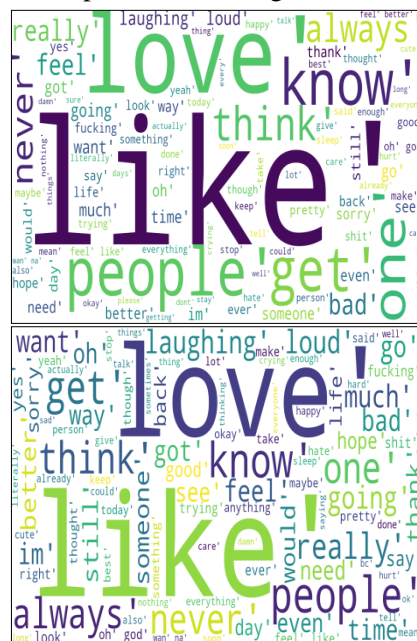
Fig. 2. Depressed posts (a) Unigrams (b) Bigrams

in Fig 2 and Fig 3. The words that appeared with a high frequency are depicted in both figures.