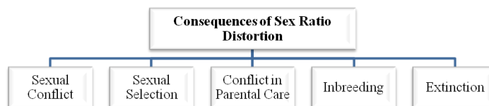
Fig.2. Consequences of sex ratio distortion in nature

double strand breaks during male-meiosis. Y- chromosome is transmitted more in subsequent generations leading to male-biased sex ratios. These examples explain how sex ratio distortion can limit the production of disease vectors and pests.